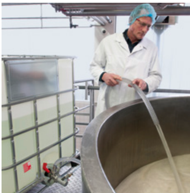
Pumping upward into a mixing container from the IBC outlet.