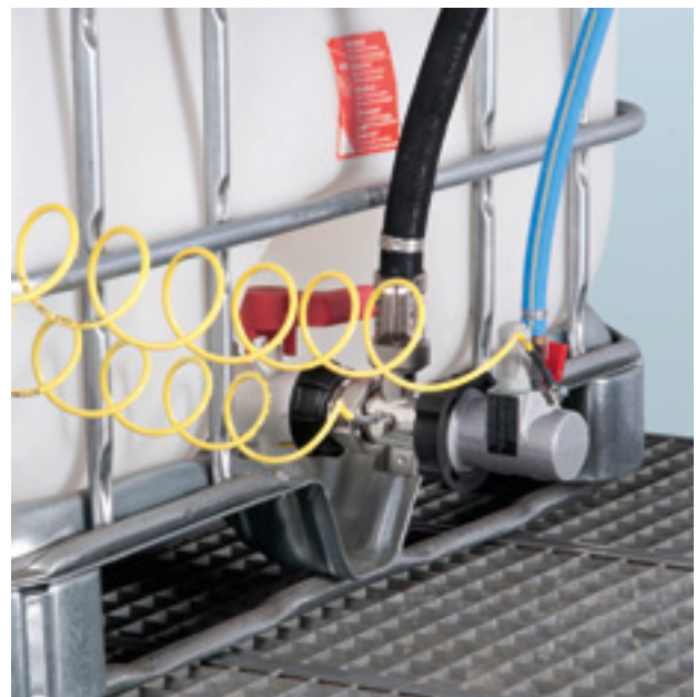
Also suitable for use in explosion hazard areas of zone 1.**