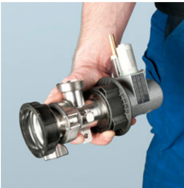
Extremely compact and light.