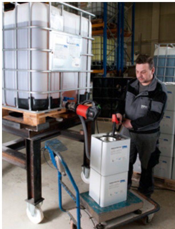
Fast container filling from the IBC outlet.