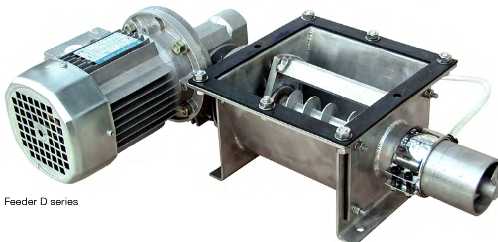
Feeder D series